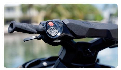
iDF – Intelligent Debris-Free Pump System

An innovative, industry-first system that allows you to free your pump of weeds and debris with intuitive handlebar-activated controls.