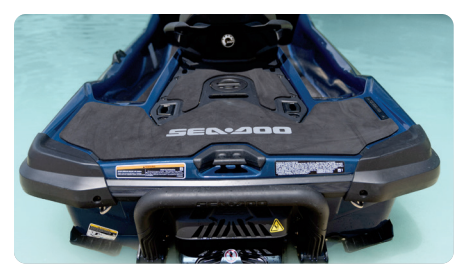
Swim Platform with Integrated LinQ System Exclusive quick-attach system on the largest

Exclusive quick-attach system on the largest swim platform in the industry allows for easy installation of storage accessories.