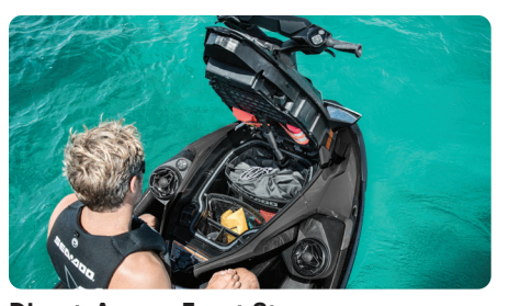
\begin{array}{l} \textbf{Direct-Access Front Storage} \\ \text{All your gear within arm's reach thanks to a} \\ 25.3 US gal (96 L) front storage area, easily \\ accessible from a seated position. Simply raise \\ the handlebars to access essentials for any \\ adventure.^1 \end{array}

An innovative, industry-first system that allows you to free your pump of weeds and debris with intuitive handlebar-activated controls.