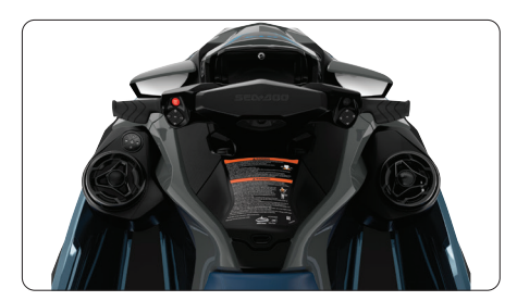
Tech Package (optional) Levels up entertainment and functionality on the water. It includes a factory-installed, truly waterproof Bluetooth audio system, a 7.8" color display and a USB port.

An innovative hull that sets the benchmark for rough water handling, stability and offshore performance.