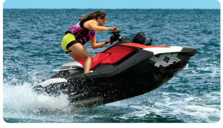
Extended Range VTS (Variable Trim System) Offers double the range of the regular VTS for greater ease when executing tricks.

Trixx Mode unlocks new water acrobatics like reverse donuts to add even more show-stopping fun to the ride. Trixx Mode offers more thrust in reverse to perform maneuvers more easily.