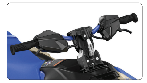
iBR – Intelligent Brake & Reverse Exclusive to Sea-Doo<sup>®</sup>, iBR stops the watercraft sooner and provides more control and maneuverability at low speeds and in reverse.

©2024 Bombardier Recreational Products Inc., (BRP). All rights reserved. (1), TM and the BRP logo are trademarks of Bombardier Recreational Products Inc. or its affiliates. In the USA, products are distributed by BRP US Inc. TAll other trademarks are the property of their respective owners. BRP reserves the right to discontinue or change specifications, prices, designs, features, models or equipment without incurring obligation. Some models shown may include optional equipment. Product performance may vary depending on external factors. All competitive comparisons are based on published manufacturer specifications at time of creating this document. The warranty is subject to the exclusions, limitations of liabilities and all other terms and conditions of BRP's standard limited warranty. Read the operator's guide and safety instructions. All models of PWC are meant to be used by drivers of age 16 and older. Observe applicable laws and regulations. Always wear appropriate protective clothing, including a personal flotation device and neoprene shorts. Riding and alcoh/drugs don't mix. Printed in Canada.