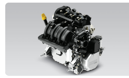
Rotax 900 ACE – 90 Engine The Rotax 900 ACE – 90 gives crisp acceleration with impressive fuel economy.