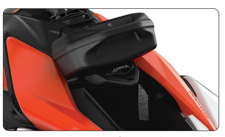
BRP Audio – Portable System (optional) The BRP Audio portable system provides higher quality sound on and off the water, featuring Concert, Ride and Home modes. Equipped with a heavy duty mounting bracket.