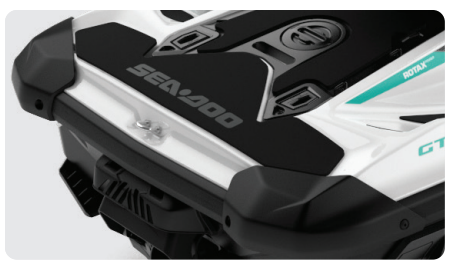
Swim Platform with Integrated LinQ System Exclusive quick-attach system on a large swim platform that allows for easy installation of accessories.