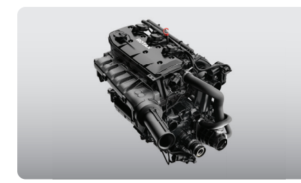
Rotax 1630 ACE – 130 Engine The powerful and reliable naturally aspirated 1630 ACE – 130 is all about fun and acceleration while providing excellent fuel efficiency.