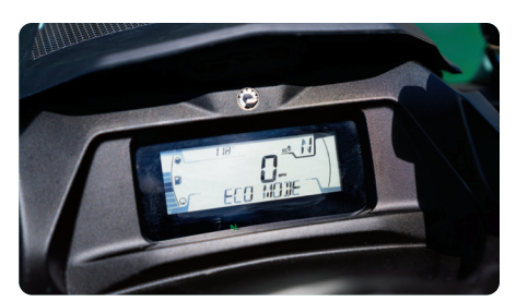
ECO Mode This exclusive Sea-Doo feature optimizes power output for up to 46% improved fuel efficiency.