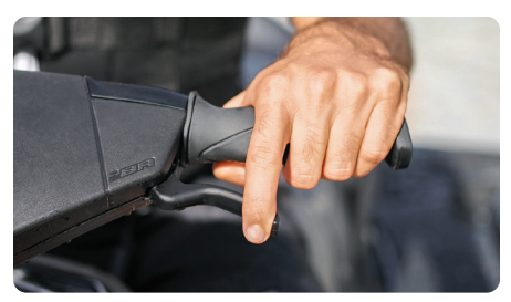
iBR – Intelligent Brake & Reverse Exclusive to Sea-Doo<sup>®</sup>, iBR stops the watercraft sooner and provides more control and maneuverability at low speeds and in reverse.