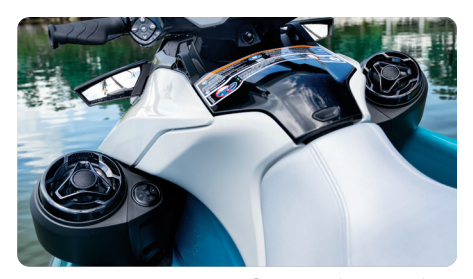
BRP Audio - Premium System (optional) A factory-installed, truly waterproof Bluetooth<sup>†</sup> audio system for an extra dose of fun and entertainment on the water.