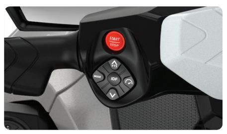
iDF - Intelligent Debris-Free Pump System (optional)

Exclusive quick-attach system on a large swim platform that allows for easy installation of accessories.<sup>1</sup>