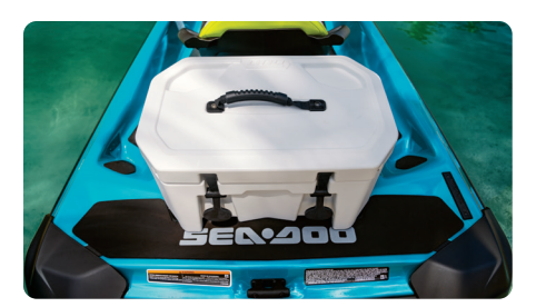
Swim Platform with Integrated LinQ System Exclusive quick-attach system on a large

Exclusive quick-attach system on a large swim platform that allows for easy installation of accessories.<sup>1</sup>