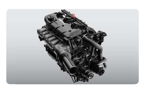
Rotax 1630 ACE - 130/170 Engines

An innovative, industry-first system that allows you to free your pump of weeds and debris with intuitive handlebar-activated controls.